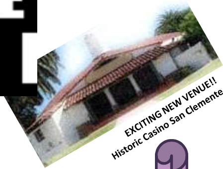
EXCITING NEW VENUE!! Historic Casino San Clemente